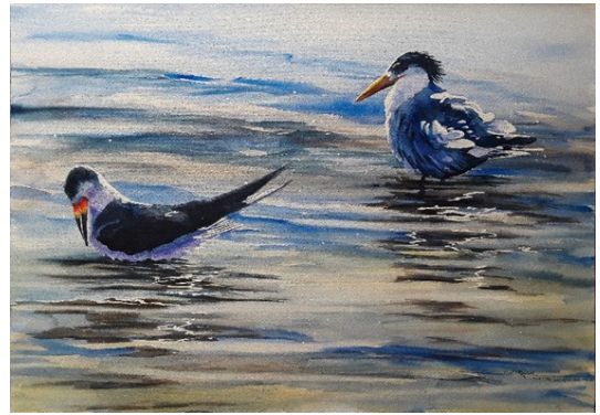
Toes in the Water