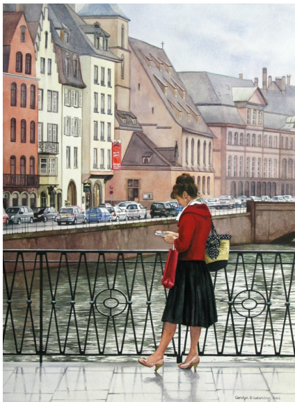
The Lady in Red, Strasbourg