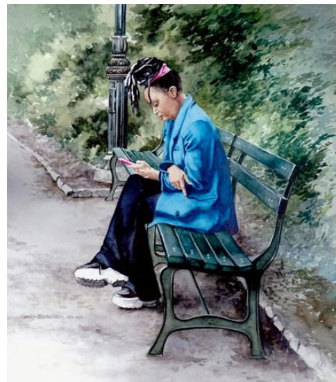
Phone Time in Central Park