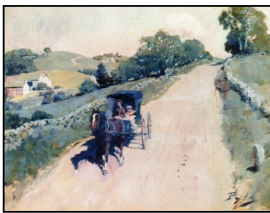
Good for the Soul (1898) Howard Pyle

Spring is when you feel like whistling even with a shoe full of slush. —Doug Larson