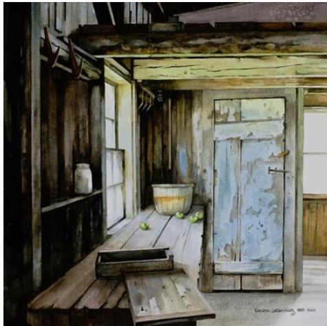
At the Olson Farm

Phone Time in Central Park — The Fallbrook Signature American Member International Exhibition .