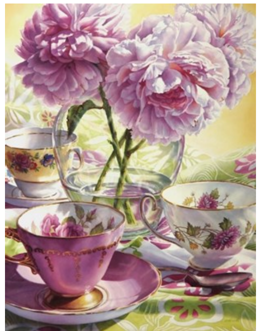
Pink Day at the Office

Featured article in Watercolor Artist Magazine , Jan-Feb 2023