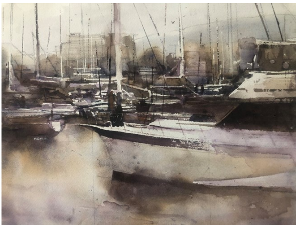
Slumbering Marina in Alameda