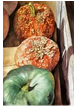
Pumpkin Pie Dreams

Pumpkin Pie Dreams also won First Prize, The Catherine Brogan Founder's Award , at the current Penn Med Valley Forge Delaware Valley Art League Exhibit .