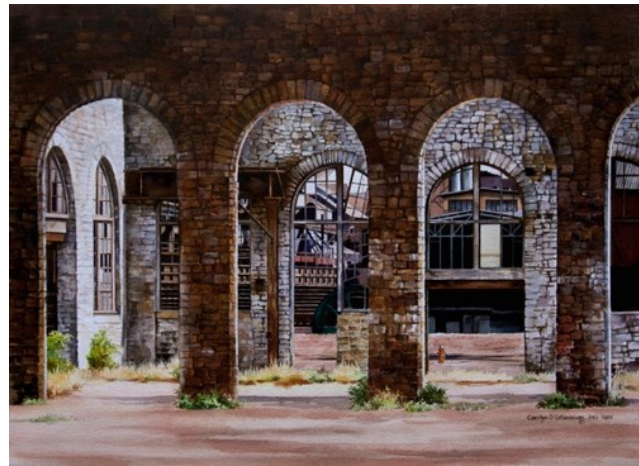
Iron Foundry Walls, Bethlehem Steel