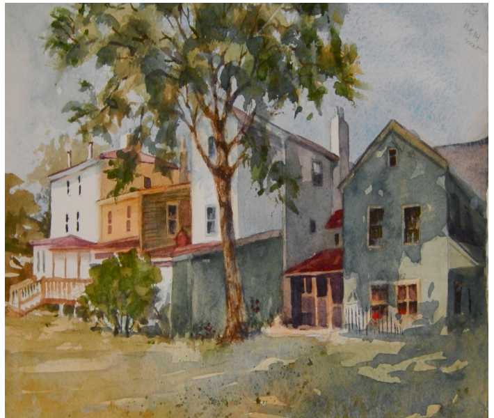
"Sugartown Village" Watercolor by WB Scheirer