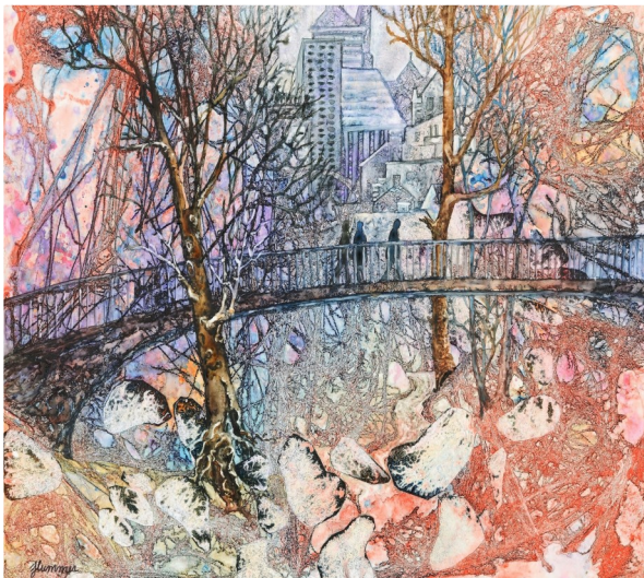
"A Walk Through the Park"