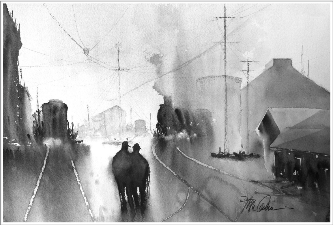
Morning in the Train Yard, 22" x 15", watercolor, by Mick McAndrews, PWCS